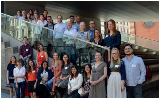
First meeting of the iPLACENTA researchers at the University of Turin, 2019

What are the underlying causes and the effects of these pregnancy complications on the mother and baby, and how can our research lead to better treatments?